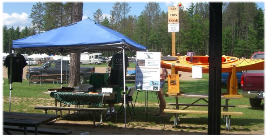
Above: The club's booth at the St Germain Flea Market.