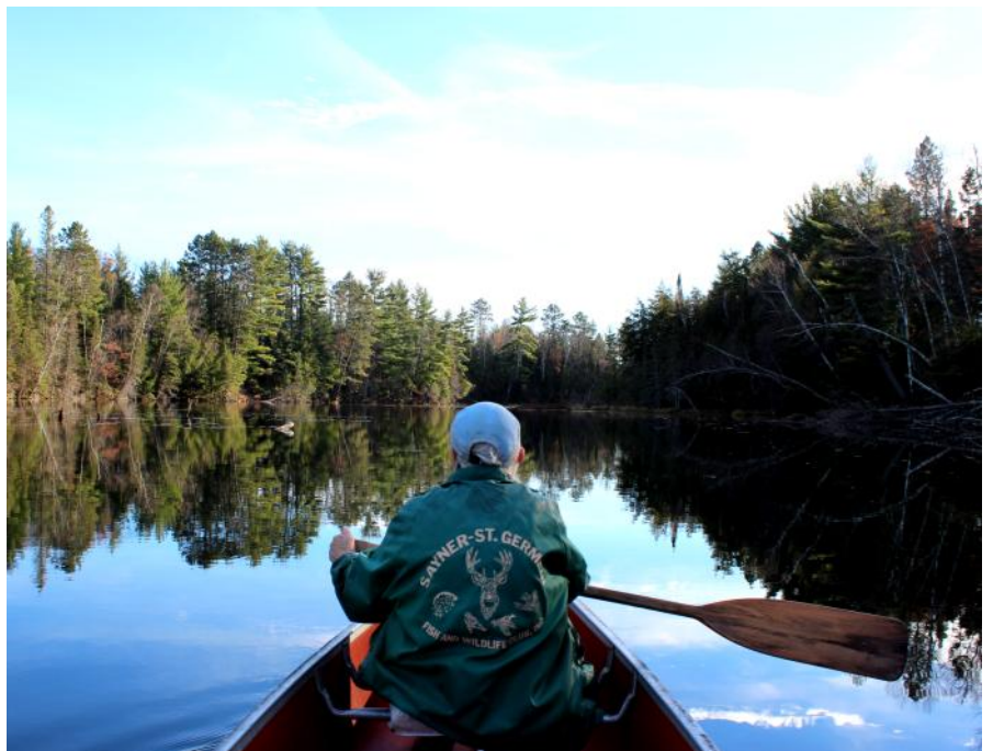
Above: Late fall paddle on the St Germain River.

http://dnr.wi.gov/topic/wildlifehabitat/training.html